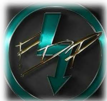
Flashback Digital Photography LLC