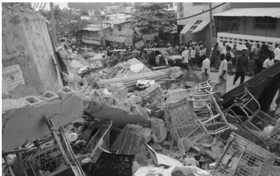
Debris lays in the street after an earthquake along the Delmas road in Port-au-Prince, Haiti, Wednesday, Jan. 13, 2010.