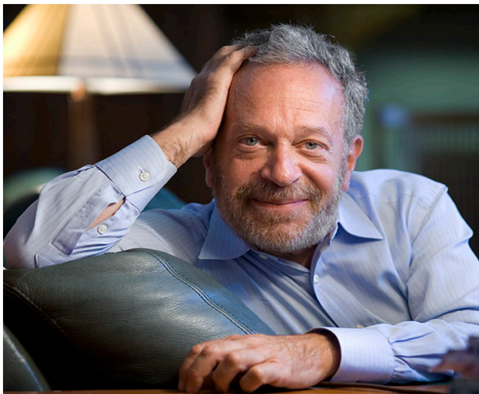
Robert Reich the nation's 22nd Secretary of Labor and professor at the University of California at Berkeley.

The dirty little secret under the hood is that less than 4 percent of the variation in the cost of current health-care plans has to do with how many benefits they provide. Most plans that cost more do so because (1) a particular set of employees is older and tends to get sicker than