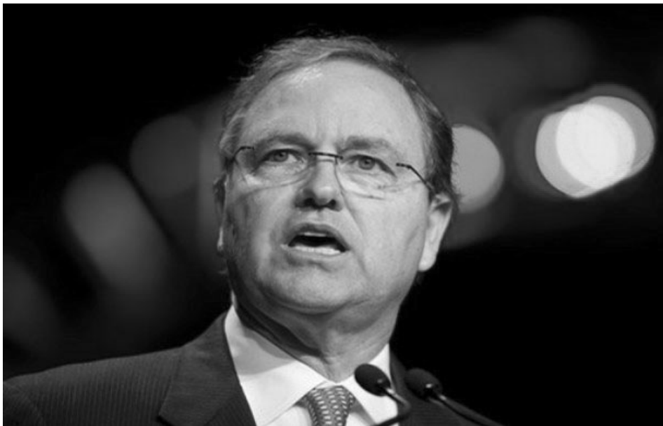
Former Wal-Mart CEO H. Lee Scott Jr.