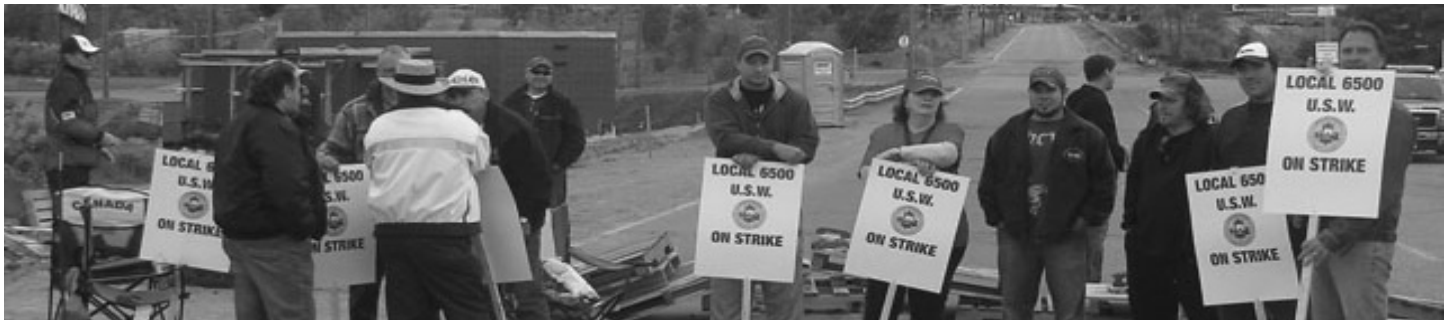
Striking Steelworkers at Vale Inco. Sudbury, Ontario July 13, 2009.

United Steelworkers (USW) - December 30, 2009